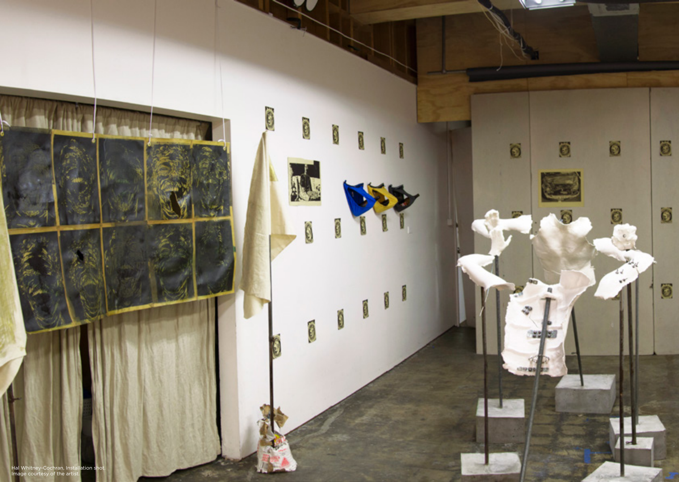
Hal Whitney-Cochran, Installation shot.